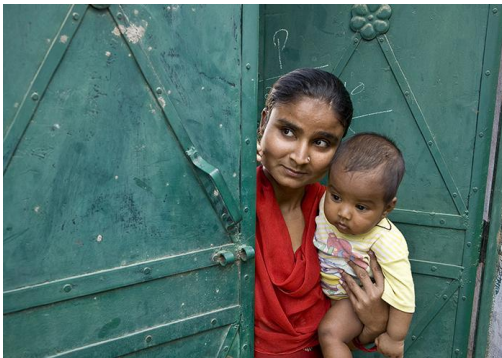
Saving Mothers and Children