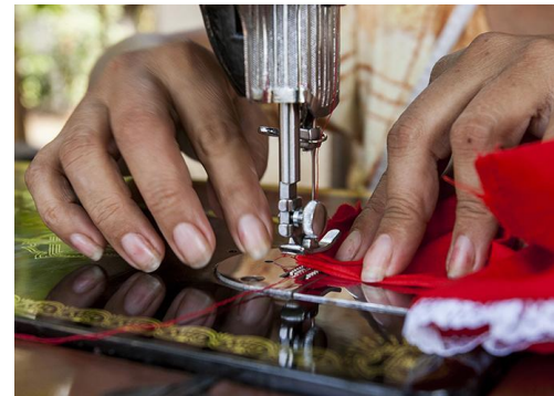
Growing Local Economies