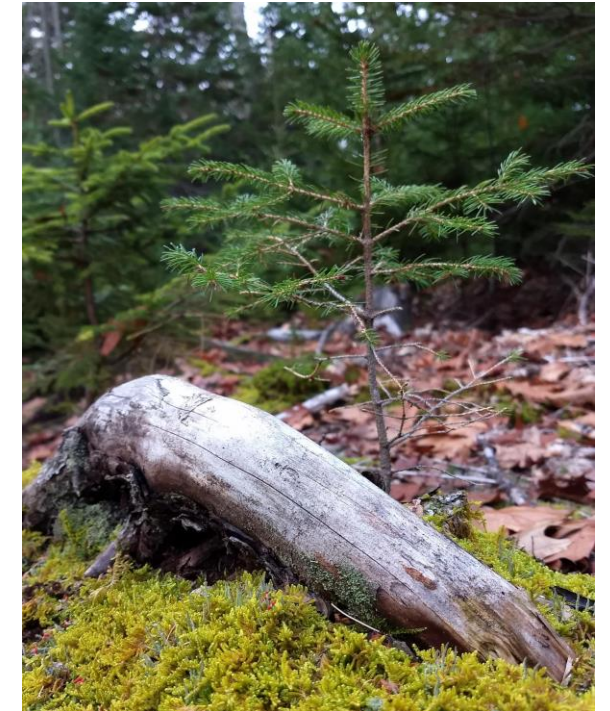
Protecting Our Environment